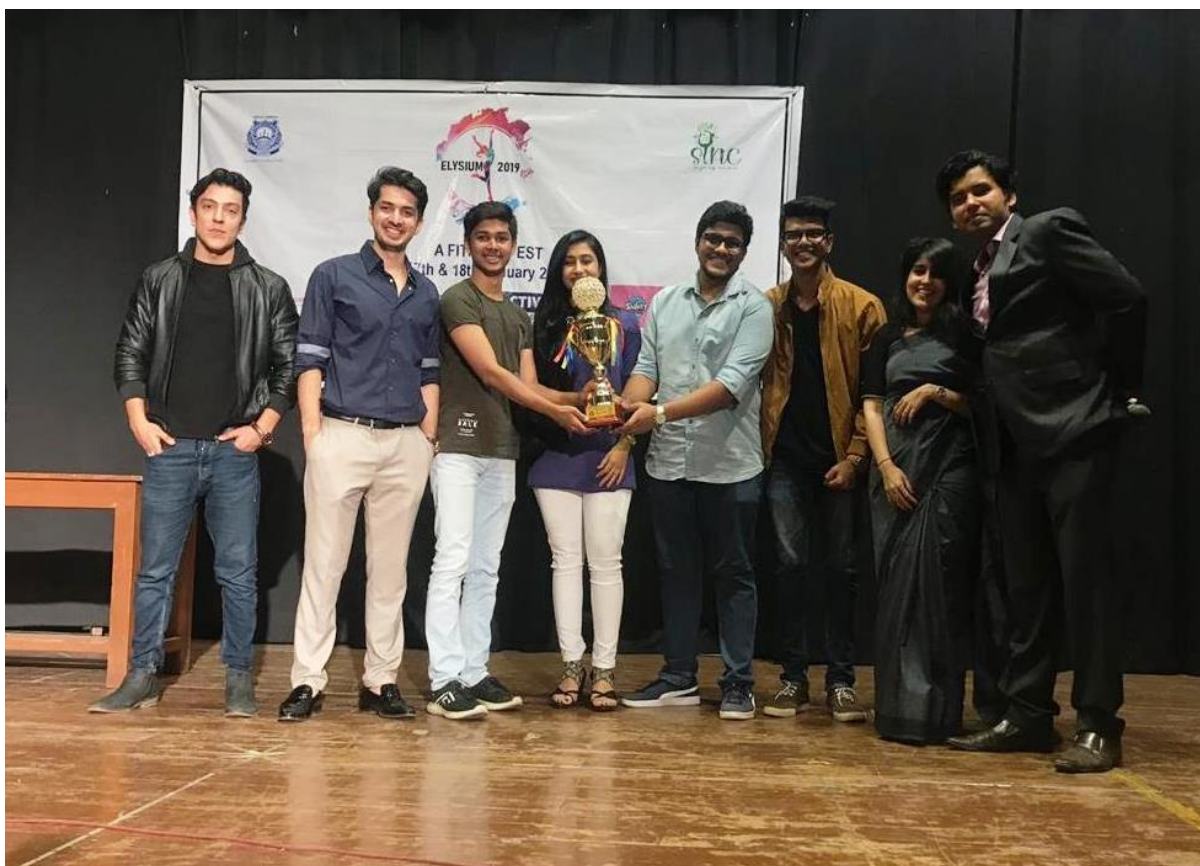
Elysium Team receiving the trophy

Below is the list of all the participants who have won a prize in all the fests throughout the year.