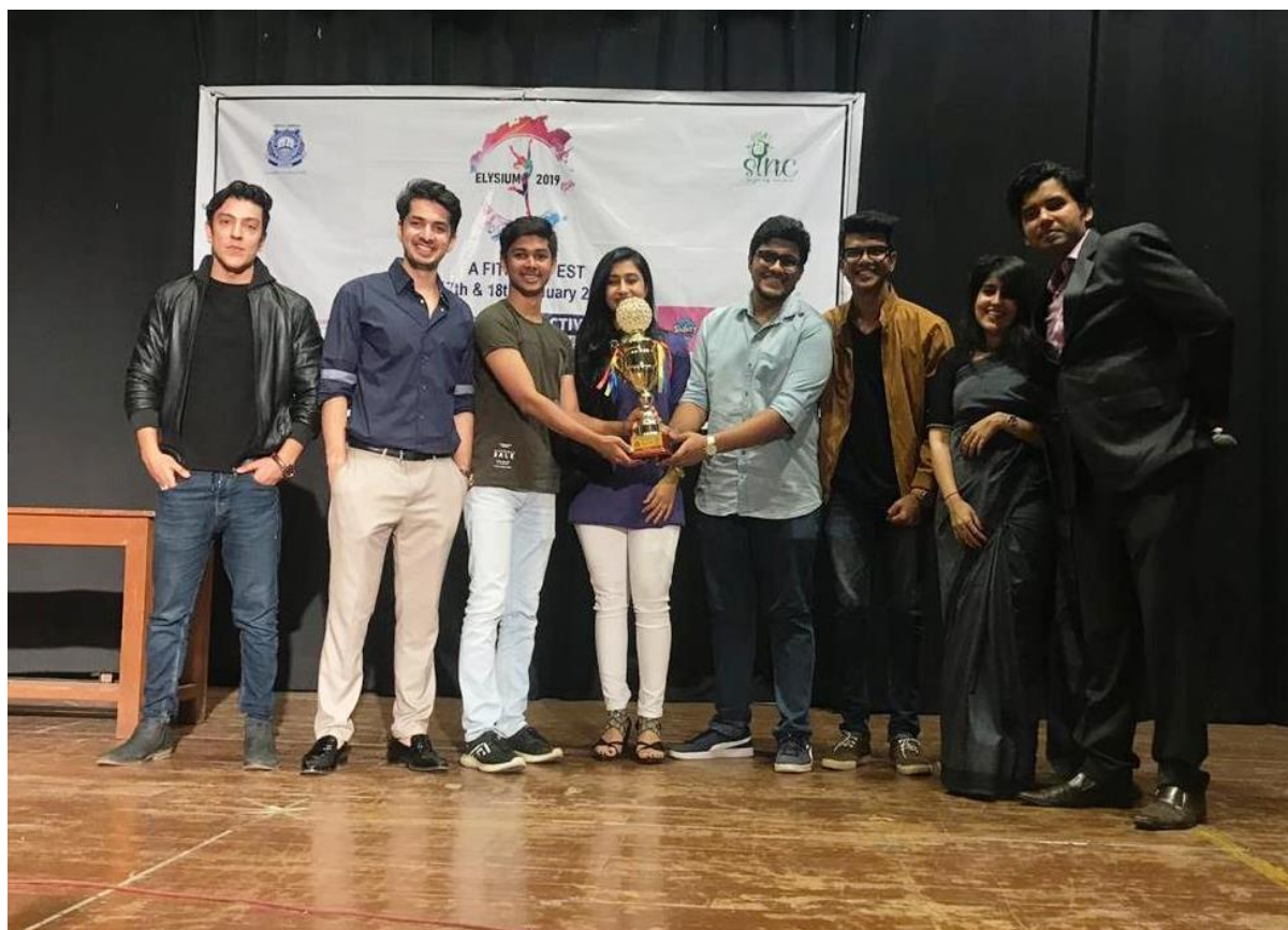
Elysium Team receiving the trophy

Below is the list of all the participants who have won a prize in all the fests throughout the year.