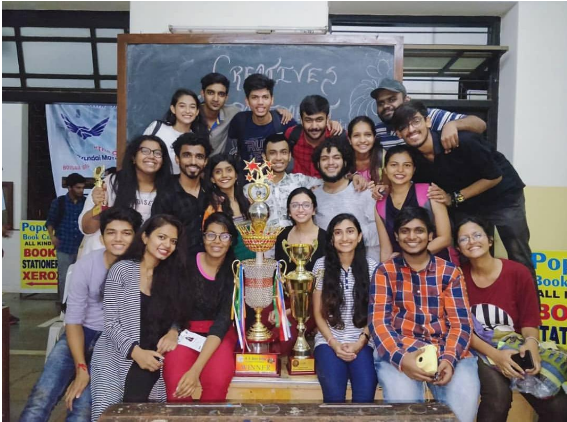
Enigma participants with the trophies