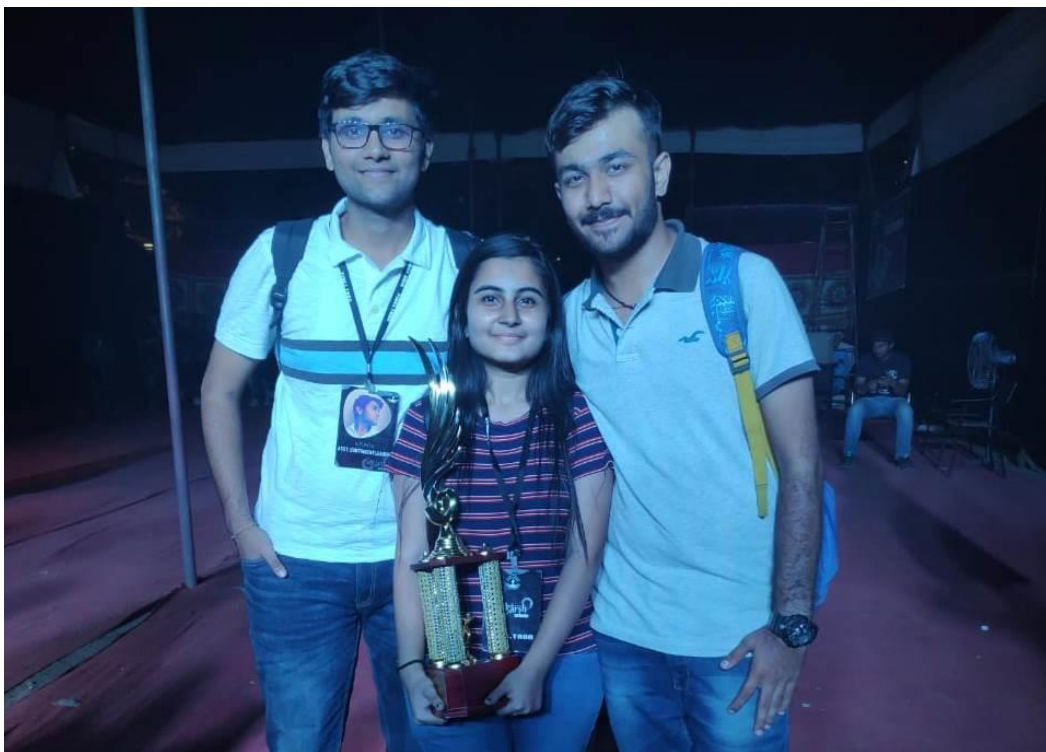
Utkarsh Team with the trophy