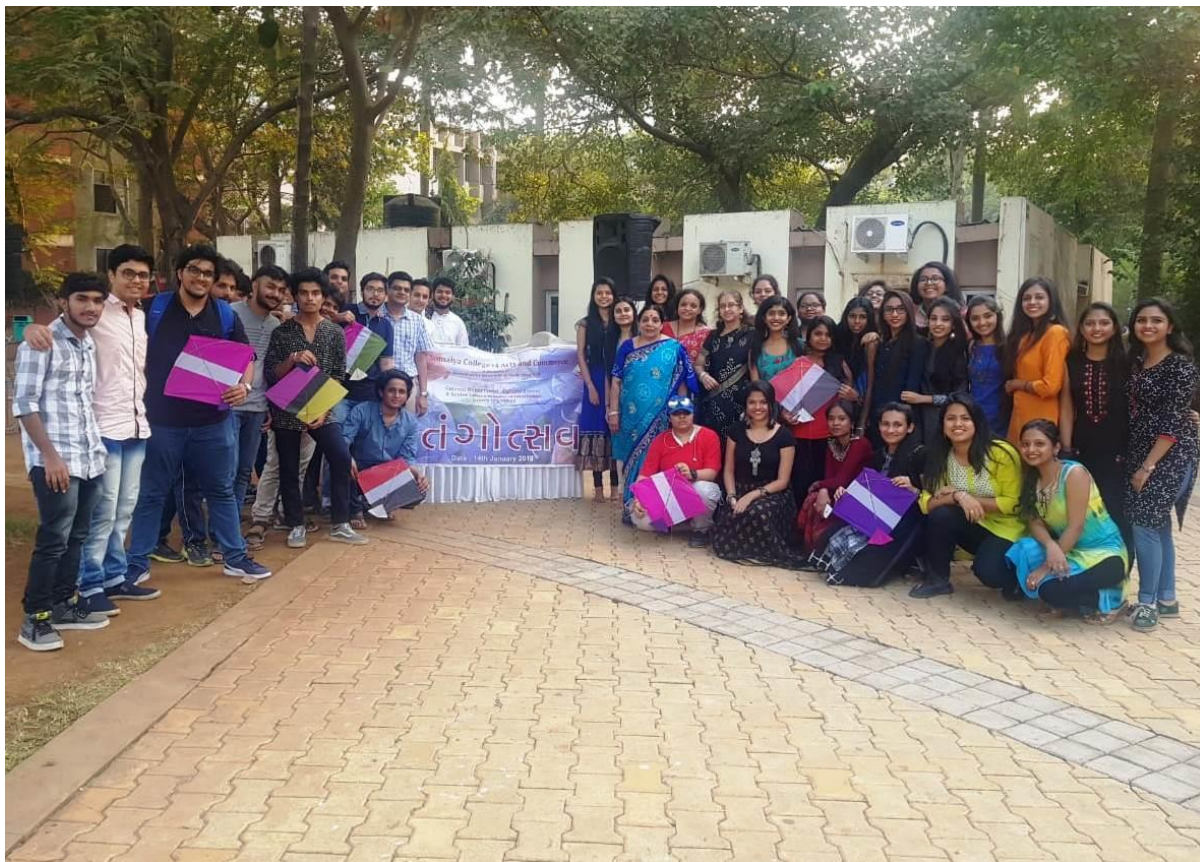
Our Principal, the coordinators of both departments, and members of both CF & GSM at Patangotsav