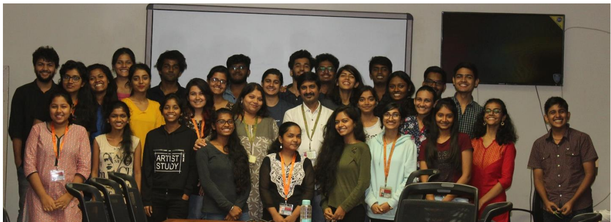
Team DFF 2018-2019

All of those team members with their consistent efforts made all the above activities of DFF successful and meaningful and set the agenda for new academic year.