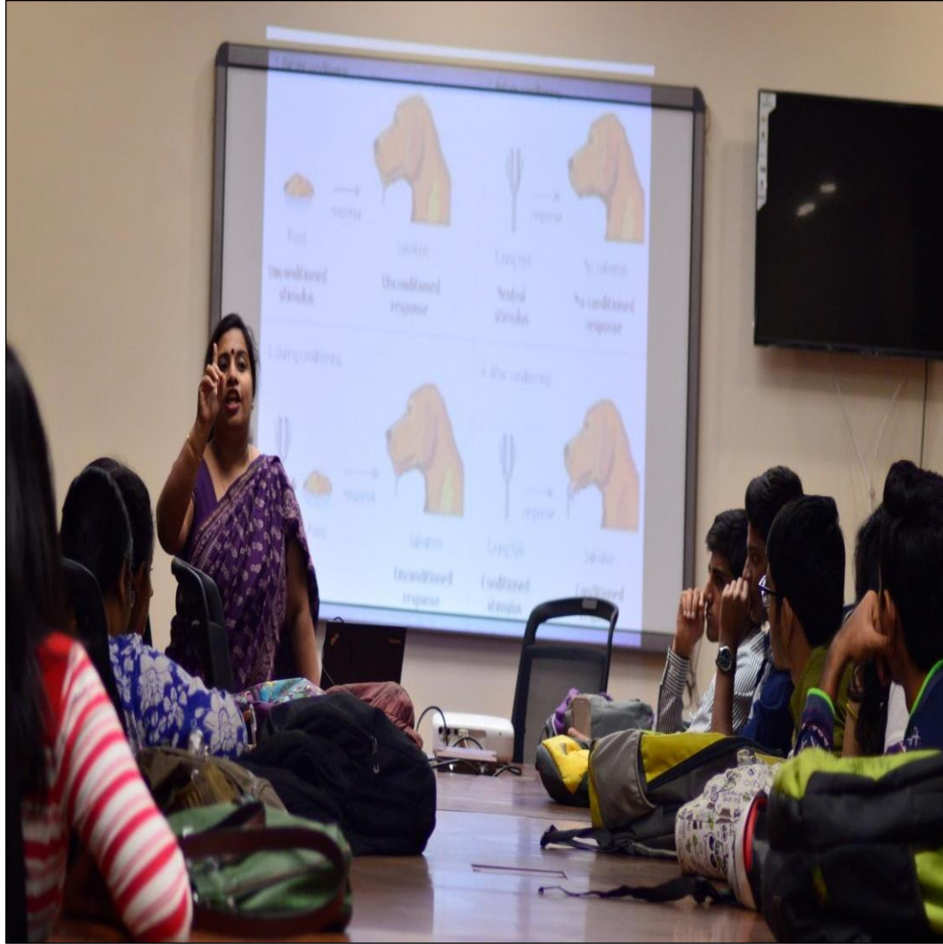
Work Ethics and Attitude Change Management.