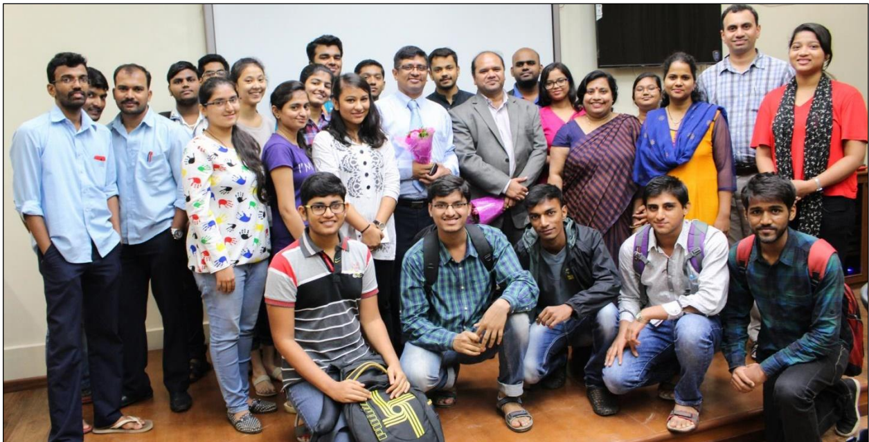
Workshop on Key Parameters to be an Entrepreneur