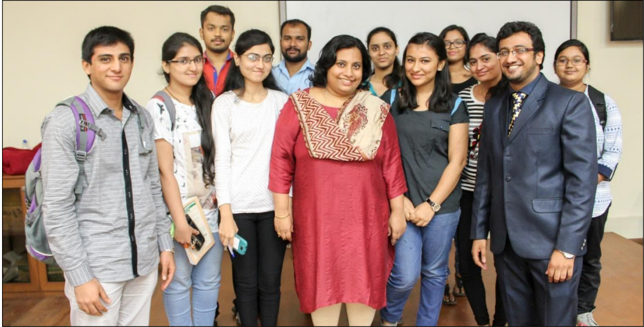
Workshop on 'How to make a Business Plan'