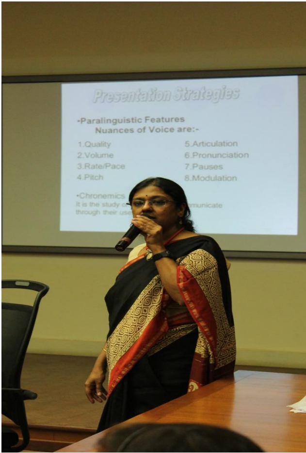
Presentation Skills and Interview Techniques