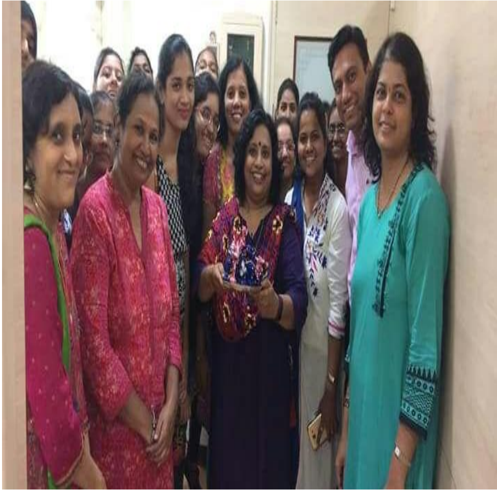
Chocolate Making Workshop