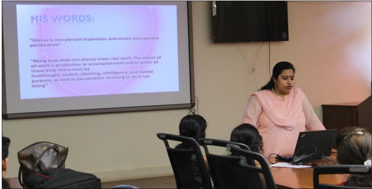
Leadership and Teambuilding